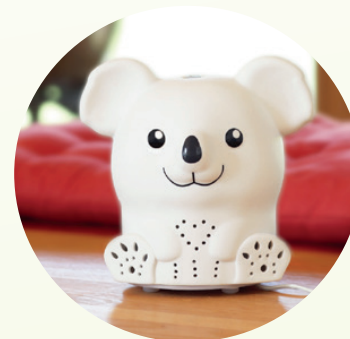
71155 Diffuser KOKO