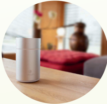
7018 Cool Breeze Diffuser