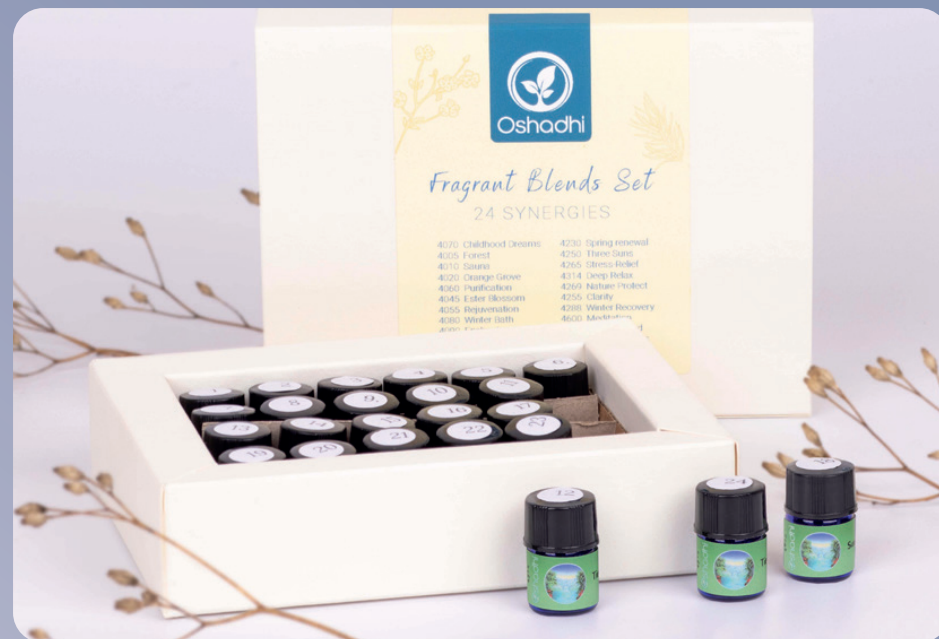
Synergy Tester Set