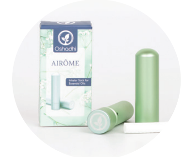
7068 Airôme mint Inhaler Stick