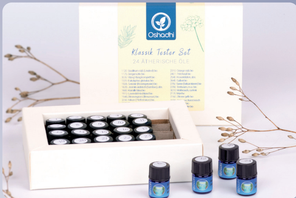
Essential Oil Tester Set