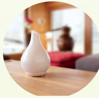
7064 Aroma Spa Ultrasonic Diffuser (pearl)