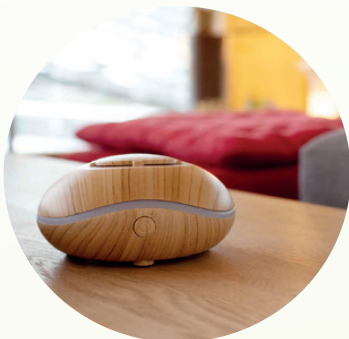
7029 Ambiance Diffuser