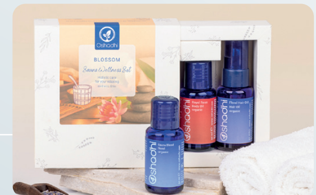
75121-150 Blossom Sauna Wellness Set