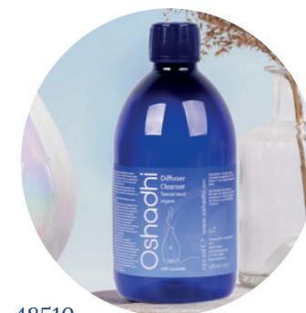
48510 Organic Diffuser Cleanser