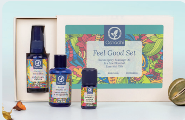
75102-65 Feel Good Set