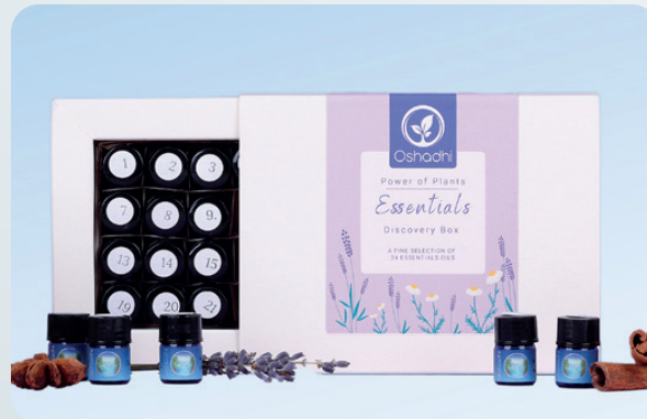
75203-24 Essentials Discovery Box