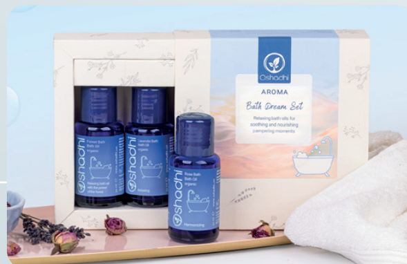
75120-150 Aroma Bath Dream Set