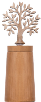
72210 Scent Tree