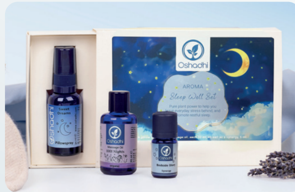
75106-65 Sleep Well Set