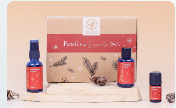
75105-65 Festive Scents Set