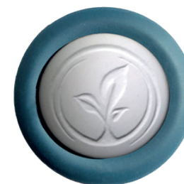
718011 Aroma stone Oshadhi with blue plate