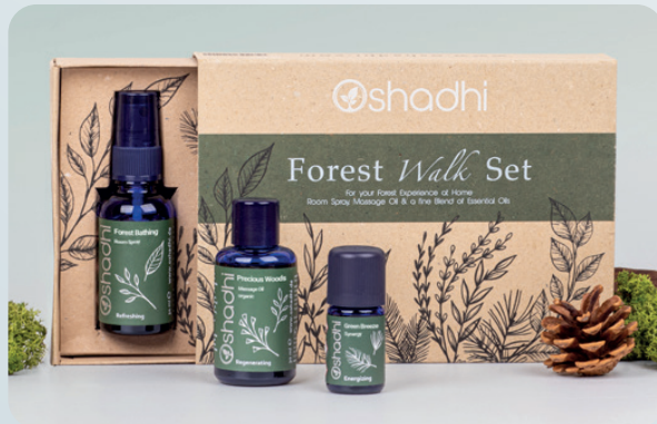
75103-65 Forest Walk Set