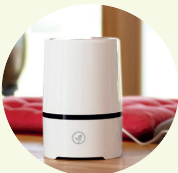
71140 Cool Air Aroma Diffuser