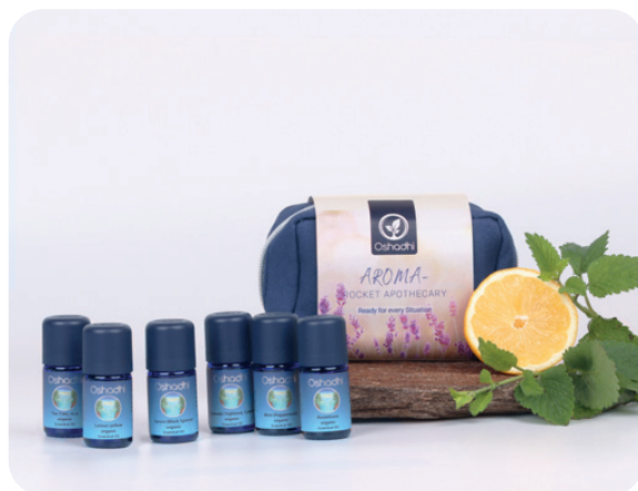
75311-30 Pocket Apothecary