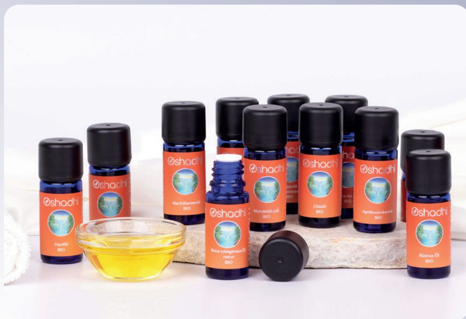
Carrier Oil Tester Set