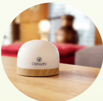
7016 Light Air Diffuser