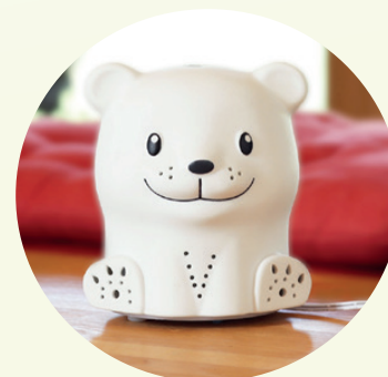
71156 Diffuser YOYO