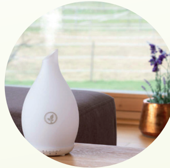
7063 Aroma Spa Ultrasonic Diffuser (white)