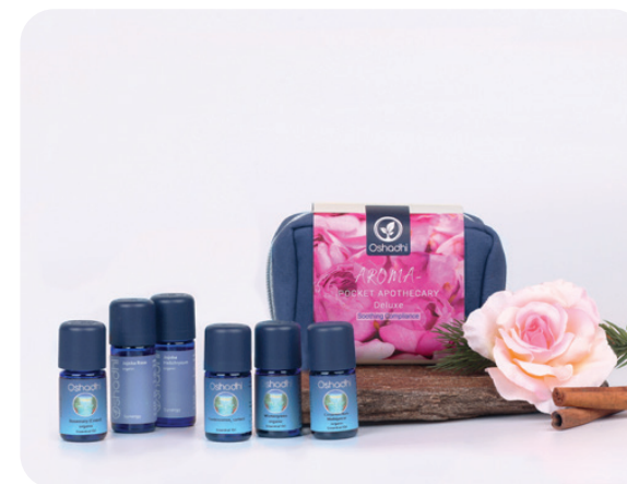
75313-40 Pocket Apothecary - DELUXE