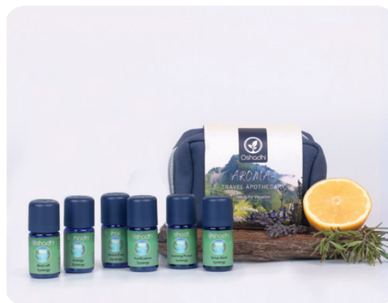
75312-30 Travel Apothecary