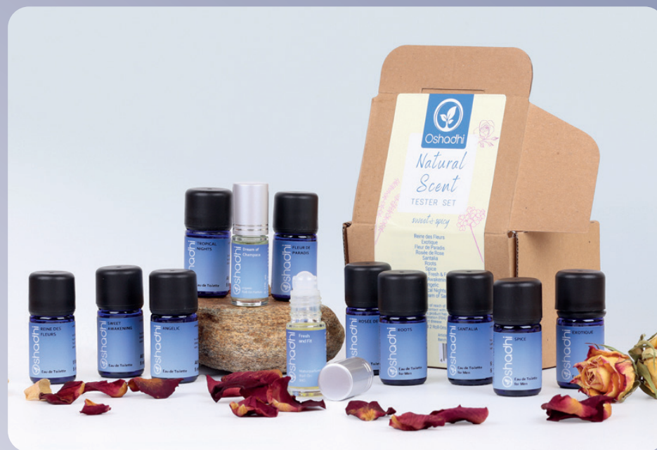
Natural Scent Tester Set