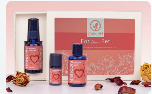
75104-65 For you Set