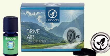
7080-5 Drive Air Diffuser and „Drive Alert“ Synergy, 5ml