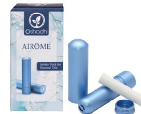
7066 Airôme blue Inhaler Stick