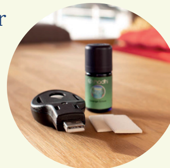
7085-5 USB Diffuser and „Orange Grove“ Synergy, 5ml