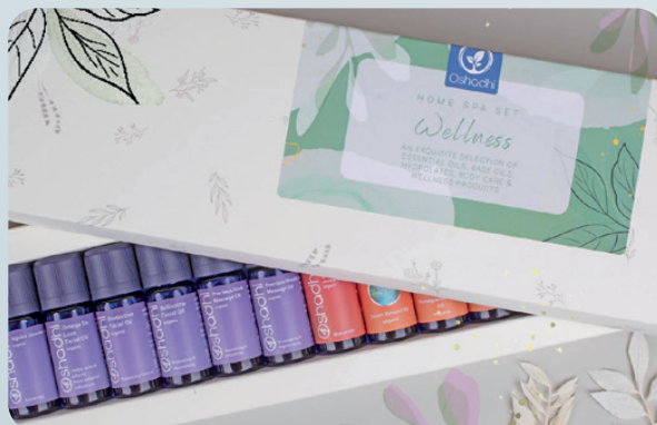
75204-240 Wellness Box