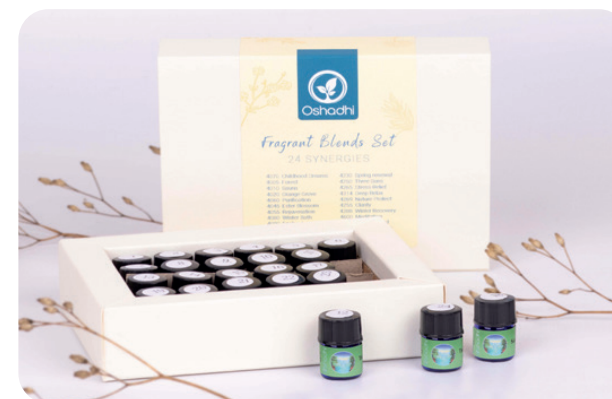
Synergy Tester Set