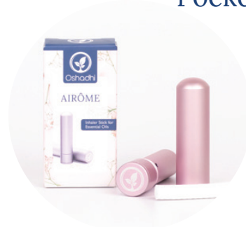
7069 Airôme rose Inhaler Stick