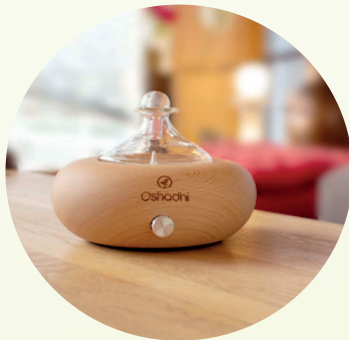
7020 Oshadhi Crystal Light Diffuser